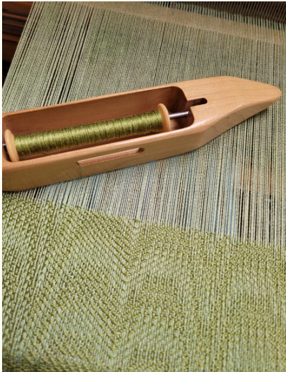
Working on the "to weave" list, an advancing twill.

Happy New Year! One of the first tasks I do at the beginning of each year is look at my "to weave" list. My list is in a steno pad, and I add projects I've bought yarn for. In 2024, I checked off quite a few projects that had been on the list since before I retired, some for much longer than intended. My goal for 2025: finish even more projects. What's on your "to do" list?